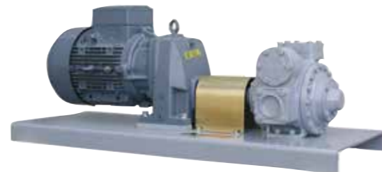
▶ Pump unit LGL2''E with gear motor