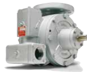
Pump model Z4200