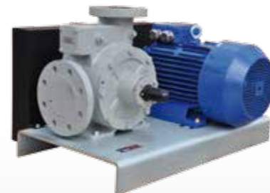
▶ Pump unit Z4500 with V-belt drive