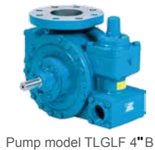
Pump model TLGLF 4''B