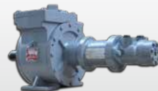
▶ Pump unit Z3500 with hydraulic drive