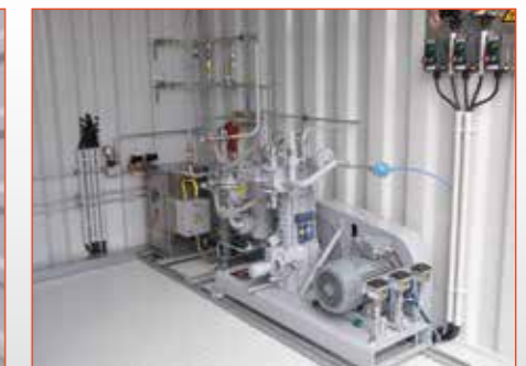
▶ Container version of a pump and compressor system according to customer specification.