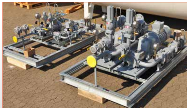
▶ Pumping system with pump model Z2000 acc. to customer specification