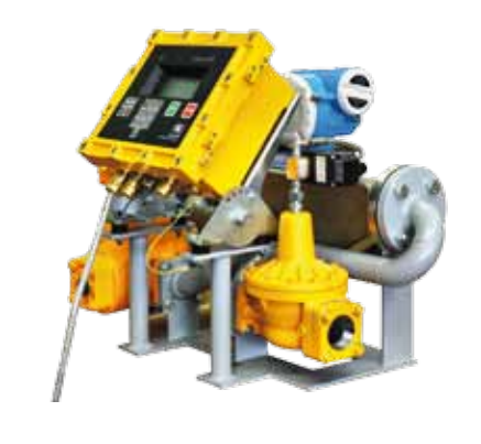
Mass and volume measurement • Various versions • Special production possible