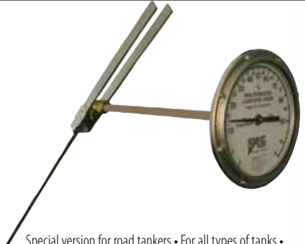
Special version for road tankers • For all types of tanks • Various mounting options