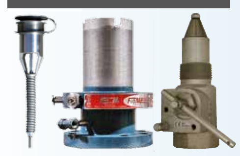
Special version for road tankers • Installation is guick and easy. and it fits in most existing tank flanges • The internal valve may be actuated manually or pneumatically