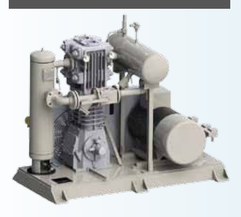
Special version for road tankers • Capacity up to 28 m<sup>3</sup>/h • Version with hydraulic drive available