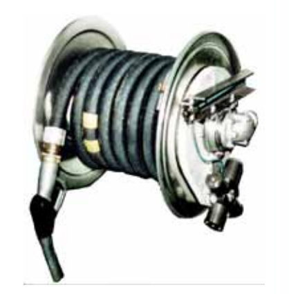
Hose reels with manual, pneumatic and hydraulic drive for high pressure hose DN 25/DN 32 (40 meter long) • Delivery with/without high pressure hose